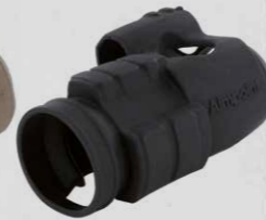
Outer Rubber Cover Color: Black. For PRO and ACO. 1.8 oz (50 g) Art. No. 12225