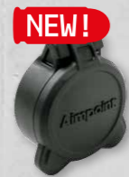
NEW! Flip-up Front Cover For Micro T-2 Art. No. 200191