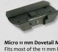
Micro 11 mm Dovetail Mount Fits most of the 11 mm Dovetail Bases ranging from 10-12,5 mm Screws and Micro Tool included Art. No. 12215