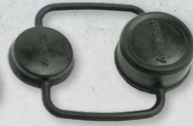
Rubber Bikini Lens Cover For CompM4 Art. No. 12205