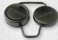
Rubber Bikini Lens Cover For Micro H-1 Art. No. 12204