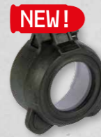
NEW! Flip-up Front Cover Transparent For Micro T-2 Art. No. 200192