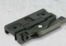
LRP Mount Lever Release Picatinny Mount for CompM4, PRO and Ring Base & Top. Return to zero after dismounting. Screws, Allen key and thread sealer included Art. No. 12198