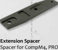
Extension Spacer Spacer for CompM4, PRO in conjunction with Art. No. 12194. Mount raises height of optical axis from 30 to 39 mm and brings sight 40 mm forwards Art. No. 12193 *