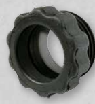
Polarization Filter Polarization Filter for reduction of sun reflection. Fits rear of CompM4, PRO and ACO sights Art. No. 12216