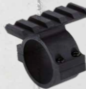
Mount Adapter 30 mm For mounting Micro sights on magnifying scopes with 30 mm tube Art. No. 200152