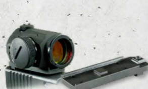
Micro mount for Glock pistols For Micro T-1. Screws, Micro Tool and Allen key included Art. No. 12437