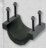
Spacer Spacer for Ring Base & Top and TwistMount Ring. Raises height of optical axis from 30 to 39 mm Art. No. 12227 *