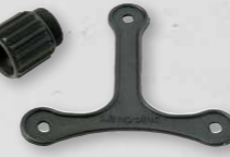
Double Battery Kit For PRO and ACO Art. No. 12247