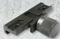
QRP2 Mount Quick Release Picatinny (MIL-STD 1913) Mount. For CompM4, PRO and Ring Base & Top. Return to zero after dismounting (Spacer is necessary for M4 flat top rifles and carbines) Art. No. 12195 *