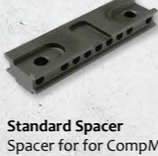
Standard Spacer Spacer for for CompM4, PRO in conjunction with Art. No. 12194. Mount raises height of optical axis from 30 to 39 mm Art. No. 12192 *