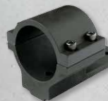
Ring Base & Top Base and Top 30 mm ring. Fits QRP2, LRP and TNP Mounts Art. No. 12194 *