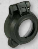
Flip-up Rear Cover Transparent For CompM4, PRO and ACO Art. No. 12240