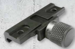
QRW2 Mount Quick Release Weaver Mount for CompM4, PRO and Ring Base & Top. Return to zero after dismounting (Spacer is necessary for M4 flat top rifles and carbines) Art. No. 11758 *