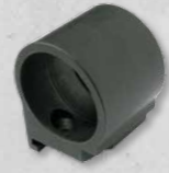
CEU Low Rise ring Ring for CEU. Fits on TwistMount Base. 30 mm height of optical axis Art. No. 12202