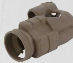
Outer Rubber Cover Color: Dark Earth Brown. For PRO and ACO. 1.8 oz (50 g) Art. No. 12226