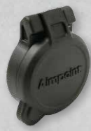
Flip-up Rear Cover For CompM4, PRO and ACO Art. No. 12224