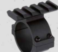
Mount Adapter 34 mm For mounting Micro sights on magnifying scopes with 34 mm tube Art. No. 200153