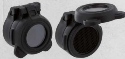
Flip-up Front Cover with Flip-up ARD Transparent (open & closed) For CompM4, PRO & ACO sights Art. No. 200122