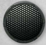
ARD KillFlash® filter for CompM4, PRO and ACO Art. No. 12239