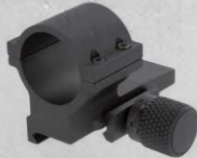
QRP3 Mount Quick Release Picatinny (MIL-STD 1913) Mount 30 mm Art. No. 12923*