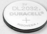
CR 2032 Lithium Battery For Micro sights Art. No. 12211