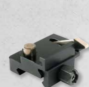
TwistMount Base Separate base for TwistMount Fits on Picatinny rail (MIL-STD 1913) Art. No. 12236