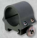
SRP-L Low Wide Ring, 30 mm Black. Fits on Picatinny rail (MIL-STD 1913) Art. No. 12243 *