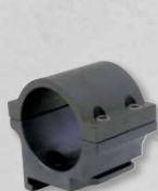
TwistMount Ring Separate ring for TwistMount Art. No. 12238 *