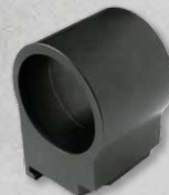
CEU High Rise ring Ring for CEU. Fits on TwistMount Base. 39 mm height of optical axis Art. No. 12203