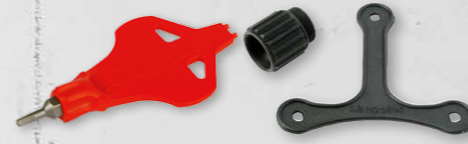
Micro Tool Art. No. 12207