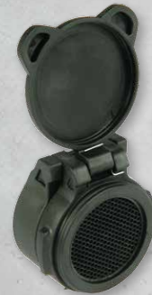
Flip-Up Front Cover with Flip-up ARD (open & closed) For PRO, ACO and CompM4 Art. No. 12462