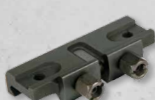
TNP Mount Torsion Nut Picatinny (MIL-STD 1913) Mount. For CompM4, PRO and Ring Base & Top Art. No. 12197 *