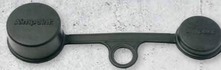
Lens Cover For PRO and ACO mounted with Quick Release Art. No. 12228