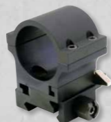
TwistMount Complete Quick Release Mount for 3XMag and CEU Fits on Picatinny rail (MIL-STD 1913) Art. No. 12234 *