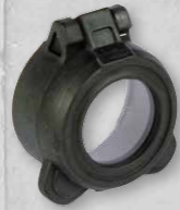
Flip-up Front Cover Transparent For CompM4, PRO and ACO Art. No. 12241