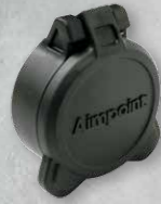
Flip-up Front Cover For CompM4, PRO and ACO Art. No. 12223