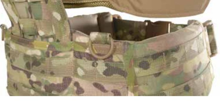
Curved stays accommodate plate volume