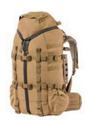
OVERLOAD 3000 cu in. + overload pg 10