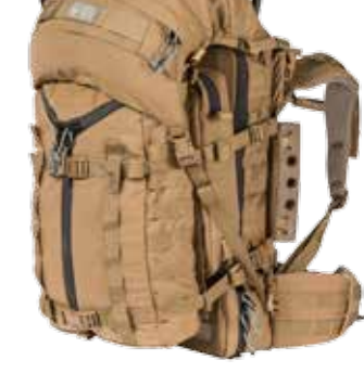
COMM 3 2500 cu in. (sustainment) pg 14