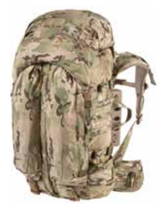
SATL 3650 cu in. pg 6