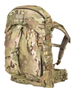
DATL 2300 cu in. pg 15