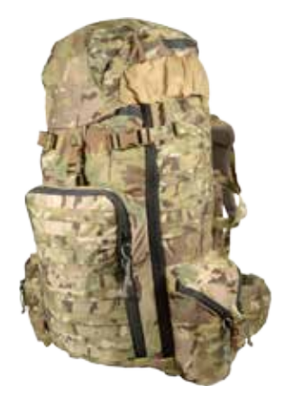
ROUS 3000 cu in. pg 13