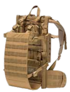
LOAD SLING NA cu in. pg 11