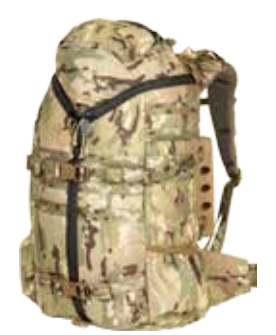
KOMODO DRAGON 2300 cu in. pg 5