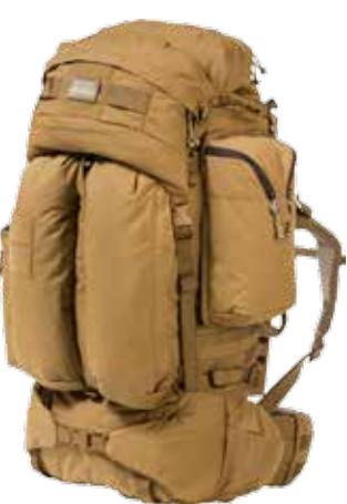
TACTIPLANE 6000 cu in. pg 7