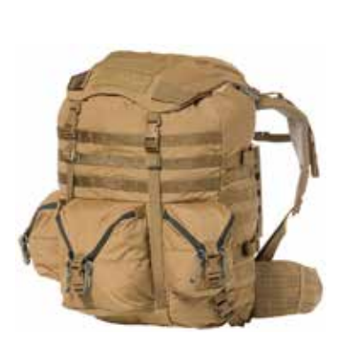
MOUNTAIN RUCK 5300 cu in. pg 8